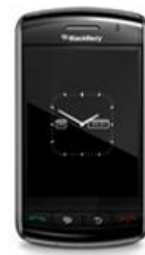
(touch screen phone)